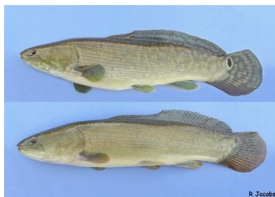
1 Male (top) and Female (bottom) Bowfin. Each are about 40 cm or 15.7 inches.

Bowfin prefer shallow, weedy lakes and slow moving rivers. Spawning occurs in the early spring when water temperatures reach 60-66 F, and males guard the nest and young until they reach about 4 inches in length. Like many species that offer parental care, male bowfin are very aggressive during this time, consequently they are easier to catch on hook and line. Bowfin grow quickly, reaching 16 inches in about two years. Reports of catching 25-30 inch fish from the Connecticut River are becoming more and more common. It is legal to fish and keep Bowfin (dead – possession of live fish is prohibited). There is no current state record (min weight 7 pounds) and a trophy is considered greater than 24 inches (see trophy fish award program below).