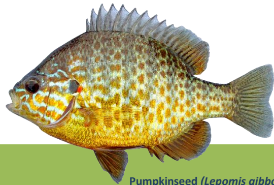
Pumpkinseed ( Lepomis gibbosus )